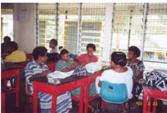
Using discussion in conjunction with other teaching strategies

Structured classroom discussions can be used in conjunction with almost all other teaching strategies. You can use discussion as part of: